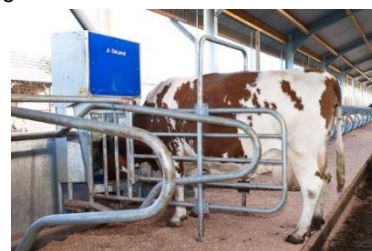
Photo 3. Concentrate feeder with a sensor for cow identification.

Concentrate feeders provide insights into the concentrate intake and also have the benefit of spreading concentrate intake over time and hence reducing acidity in the rumen. Decreased feed intake is also detected in the feeding stations. This can be an early sign of health disturbances.