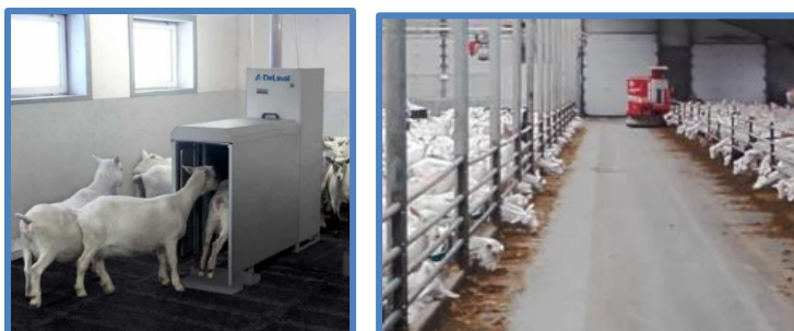
Photo 2. Left photo: Example of automatic individual feeder for adult goats. Right photo: Example of automatic feeder for groups.

On the other hand, automatic feeders for kids are also a great investment. They have grown in popularity because they can save hours of daily hand-work (reduced labour cost and labour flexibility), feed smaller proportions more often (so prevent gorging and bloating), increase daily gains, maintain high hygiene and improve health of animals.